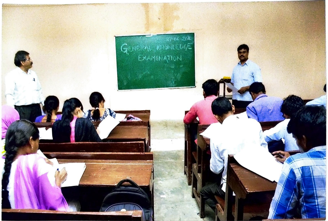
Students' Participation in General Knowledge Exam